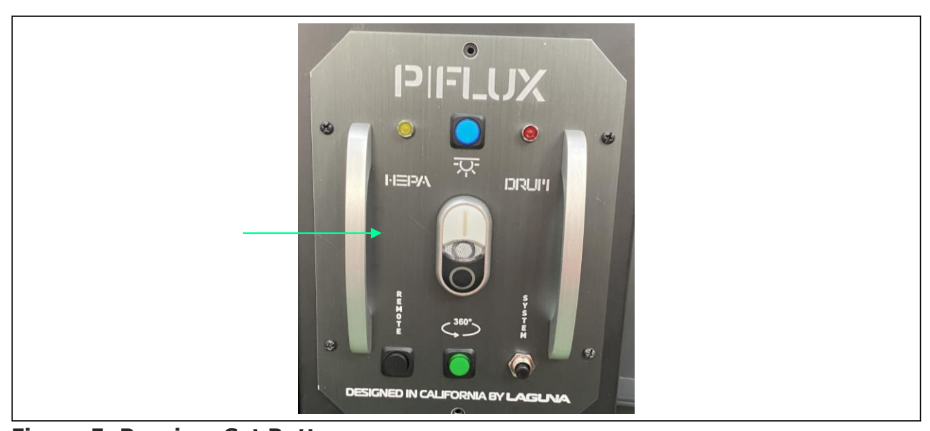
Figure 5: Receiver Set Button