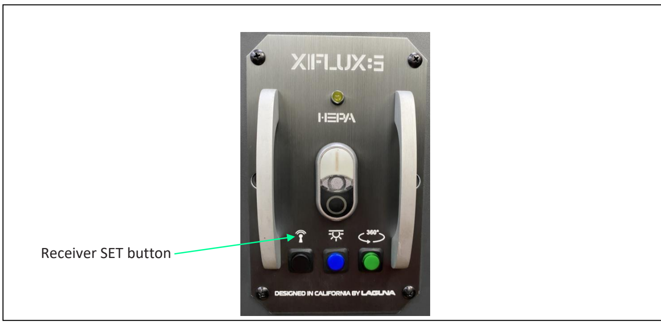
Figure 6: Receiver Set Button