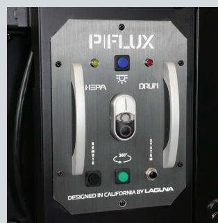
Centralized Control Panel Can be Mounted on Left/Right Side