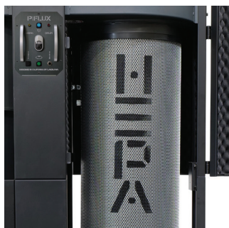
HEPA Filter w. Automatic Cleaning