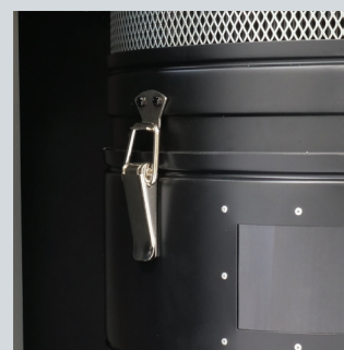
Drum Quick Release Pulls Drum Firmly Against Lid