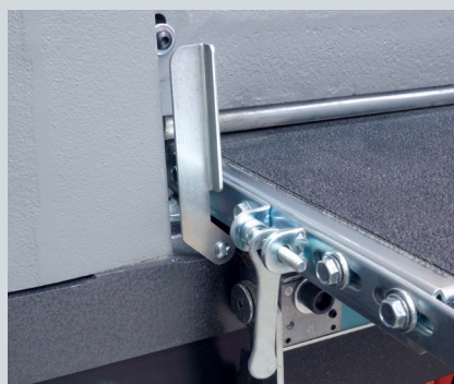
FAST ADJUSTMENT LEVER