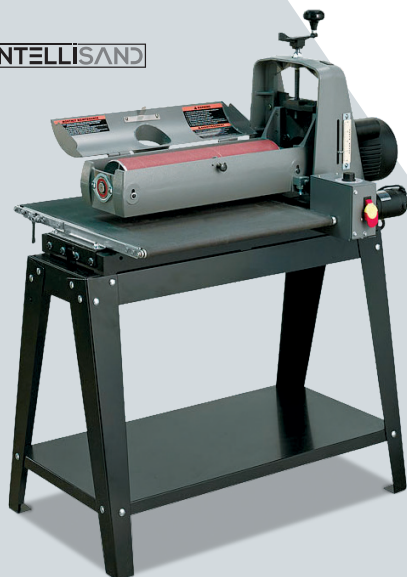
CAST IRON BODY