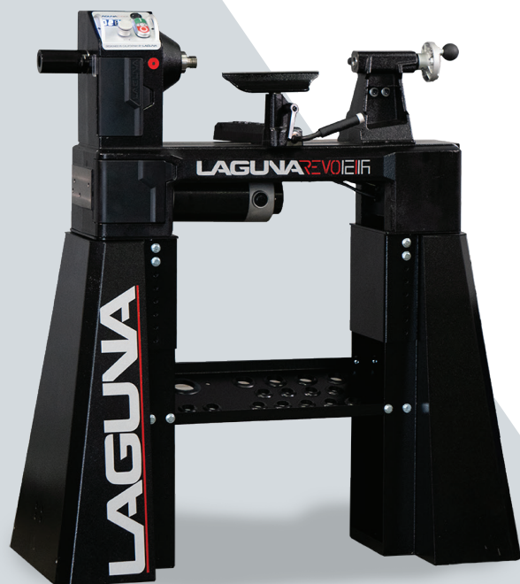
"Shown with optional stand"