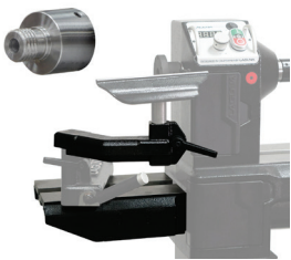
ALAREVO1216 20" EXT.

The Revo comes standard with two pre-drilled brackets that allow users to install dual lights without drilling.