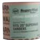
Individual Wraps See page 20 for details.