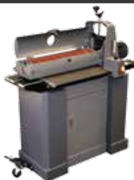
25-50 DRUM SANDER WITH CLOSED STAND AND BUILT-IN CASTERS