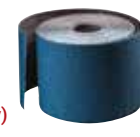
Aluminum oxide and zirconium* 24-120 grit (specify) See page 20 for details.