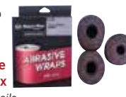
36-220 grit, three (3) wraps per box See page 20 for details.